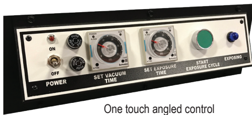
One touch angled control panel (E-200 and E-100)